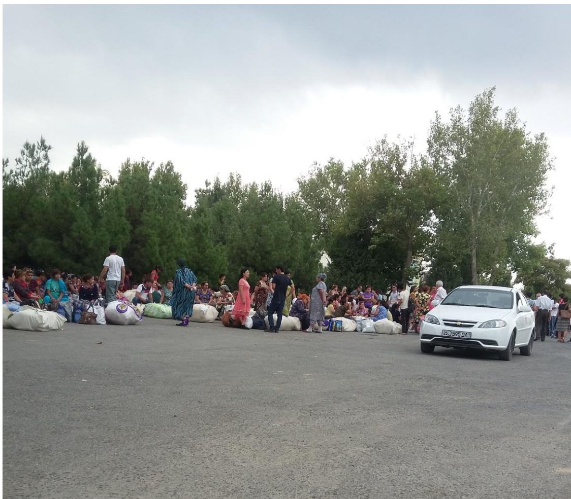
(Photo: Jizzakh State Pedagogical Institute students on the way to the cotton fields, September 10, 2016)

On September 7, students from the Karshi City Pedagogical University were mobilized to the cotton fields. According to a student speaking to an UGF monitor, it is compulsory work – if the students refuse to participate, they are threatened with expulsion from University. Students are